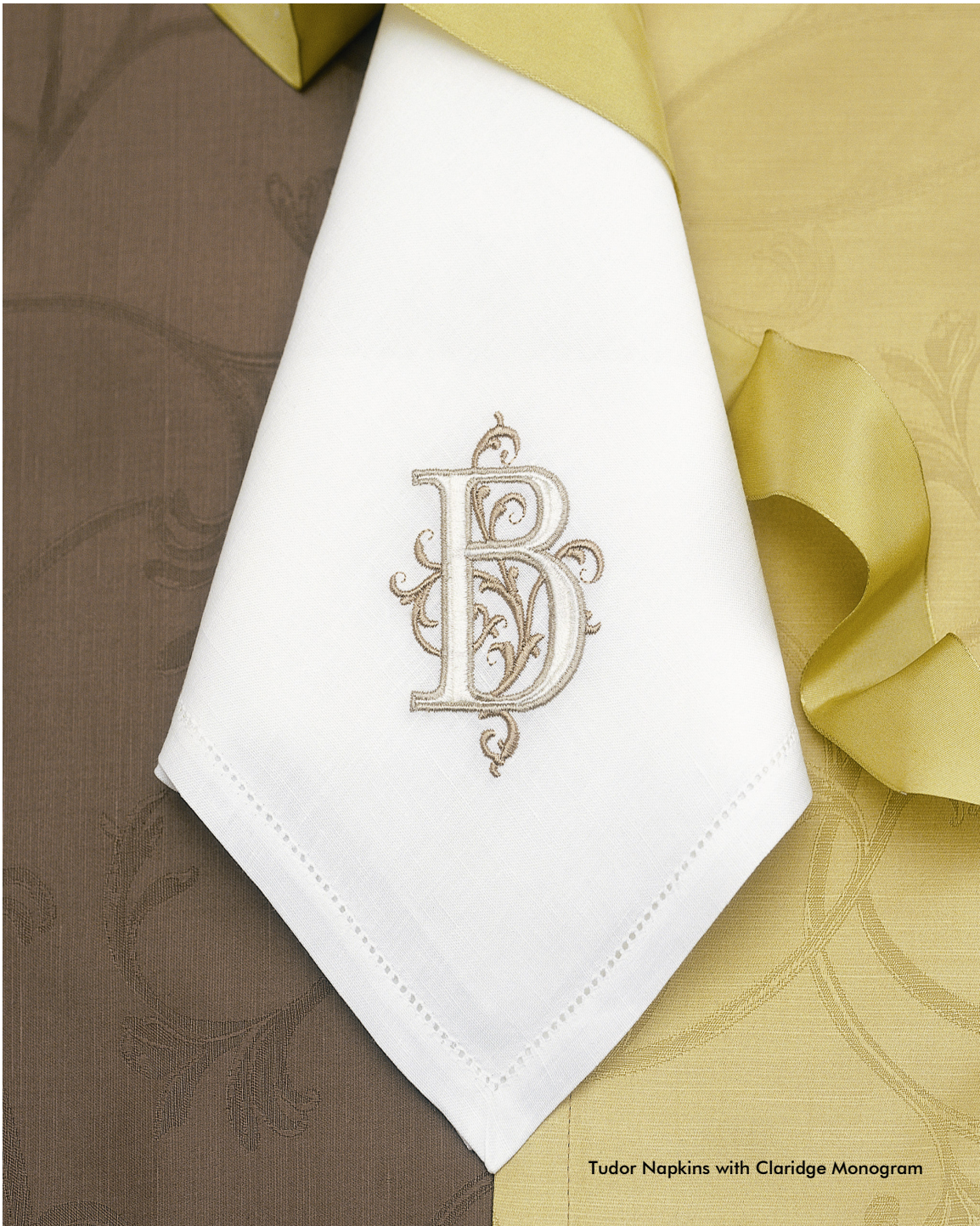
Tudor Napkins with Claridge Monogram