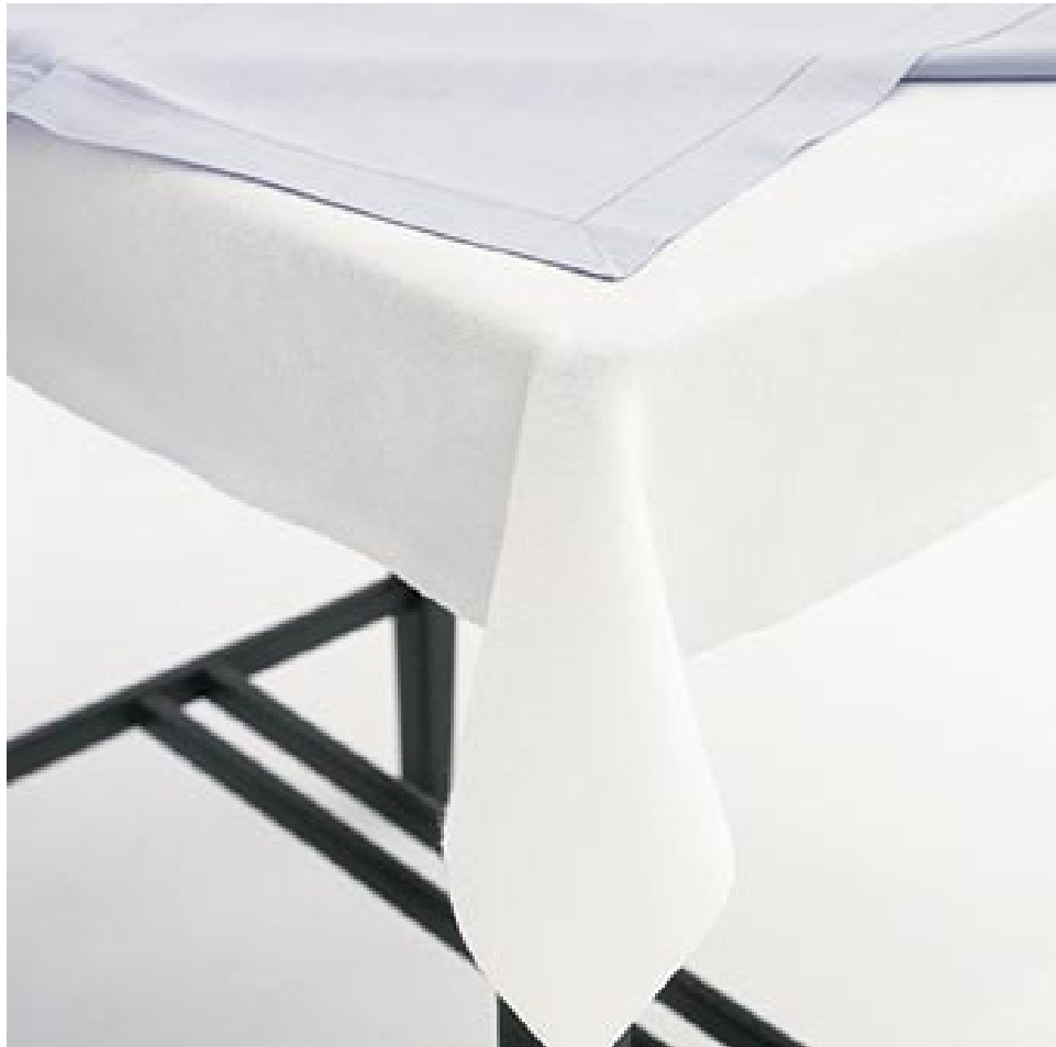
Felt Table Liner