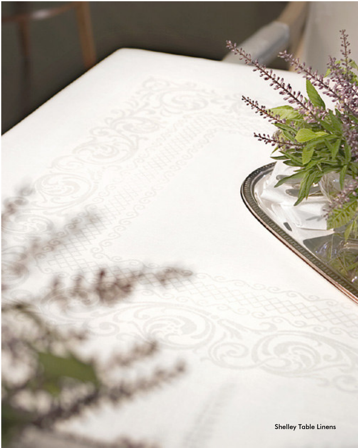
Shelley Table Linens