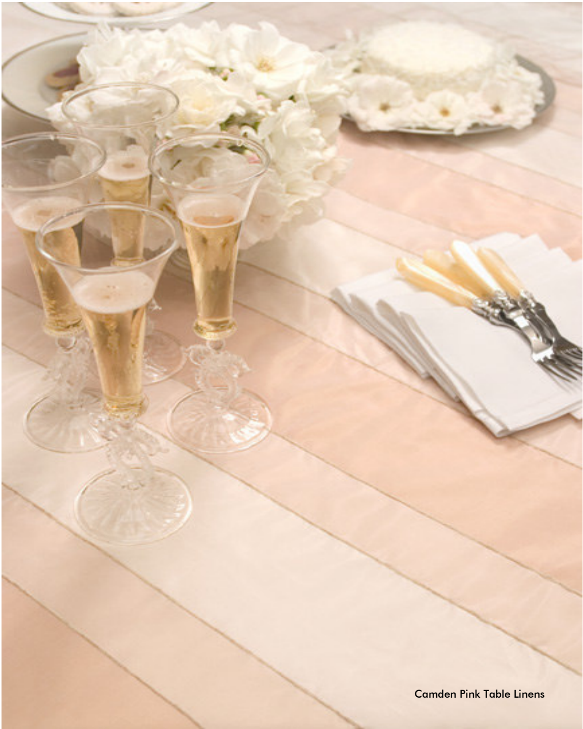
Camden Pink Table Linens