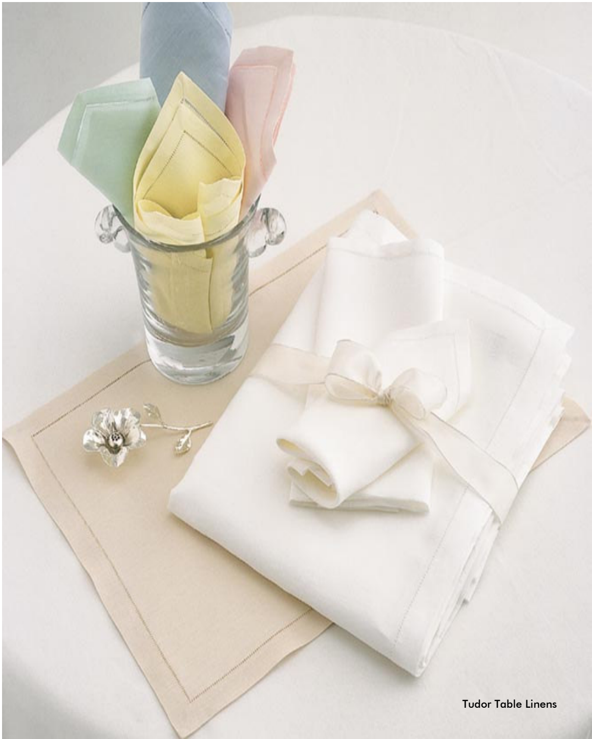
Tudor Table Linens