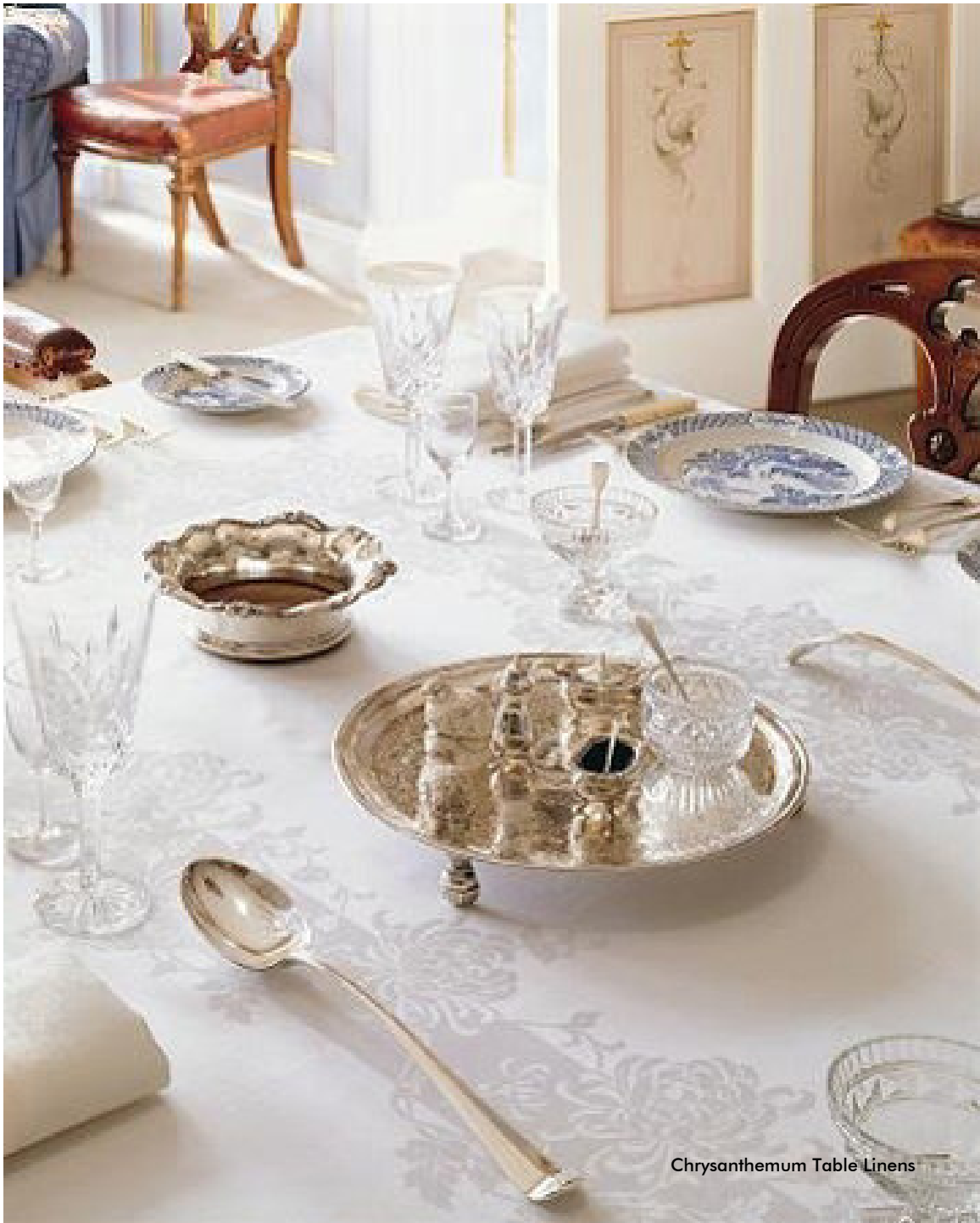
Chrysanthemum Table Linens