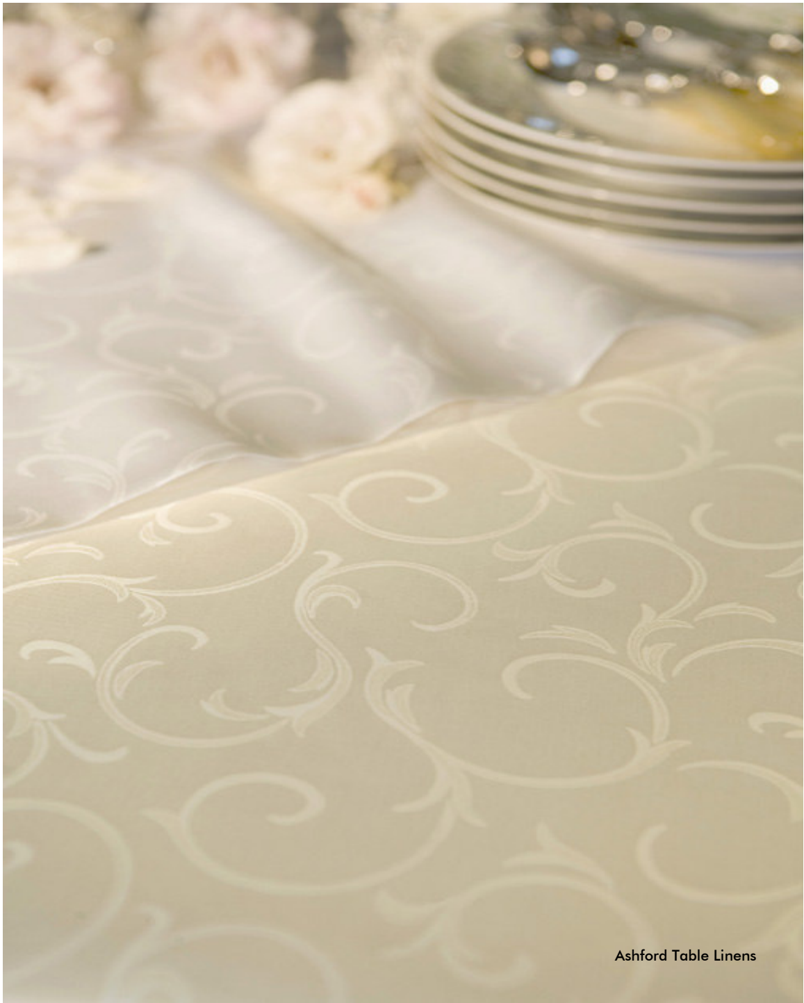
Ashford Table Linens