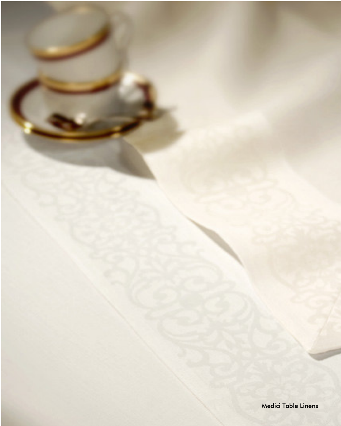
Medici Table Linens